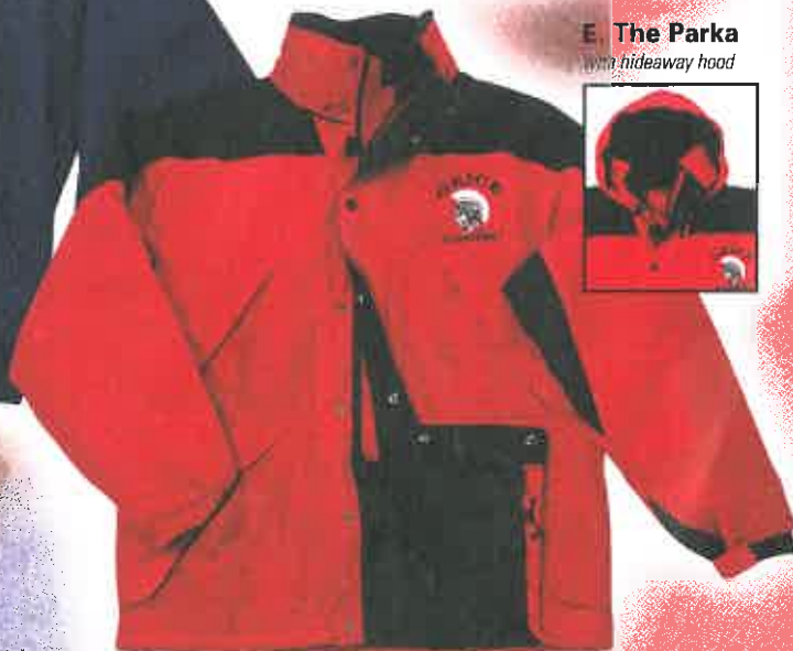
E. The Parka with hideaway hood