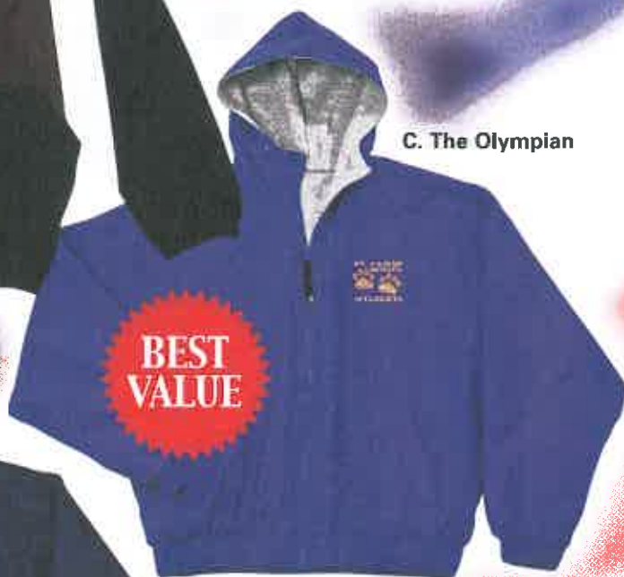
C. The Olympian