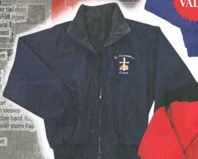
D. The Three Seasons