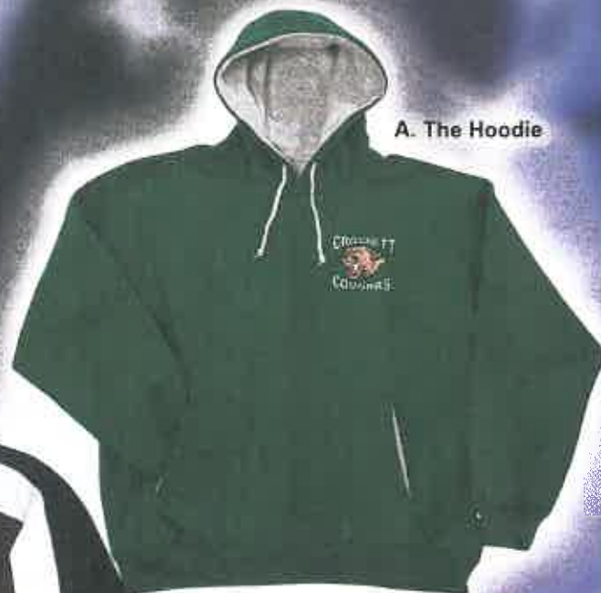
A. The Hoodie